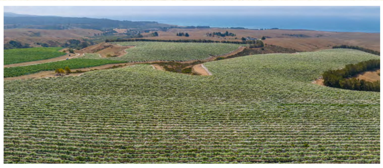
THE ENCLOSED INFORMATION HAS BEEN OBTAINED FROM SOURCES THAT WE DEEM RELIABLE; HOWEVER, IT IS NOT GUARANTEED BY CLARK COMPANY AND IS PRESENTED SUBJECT TO CORRECTIONS, ERRORS, PRIOR SALE, CHANGES OR WITHDRAWAL FROM THE MARKET WITHOUT NOTICE.