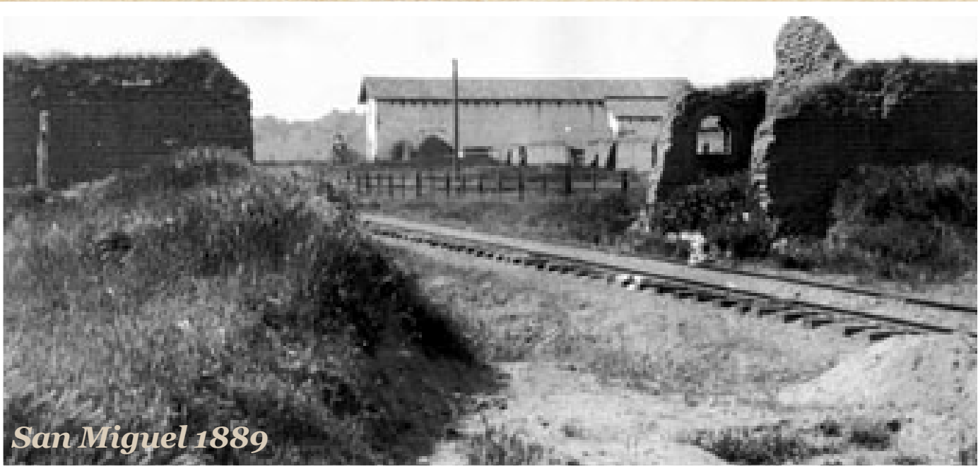
San Miguel 1889

With a population of approximately 1,500, San Miguel is a small town in Central California's Wine Country, adjacent to Highway 101. The jewel of the town is the famous Mission San Miguel Arcangel founded by Franciscan Father Fermin Lasuen in 1797. The "town" of San Miguel, likely began with the Rios-Caldeonia Adobe, which was constructed in 1835. By 1871, a stagecoach ran daily from San Miguel to San Luis Obispo, and in 1886, Southern Pacific Railroad reached San Miguel. Shortly thereafter, the town was leveled by a disastrous fire, and the new town was rebuilt north of the Mission.