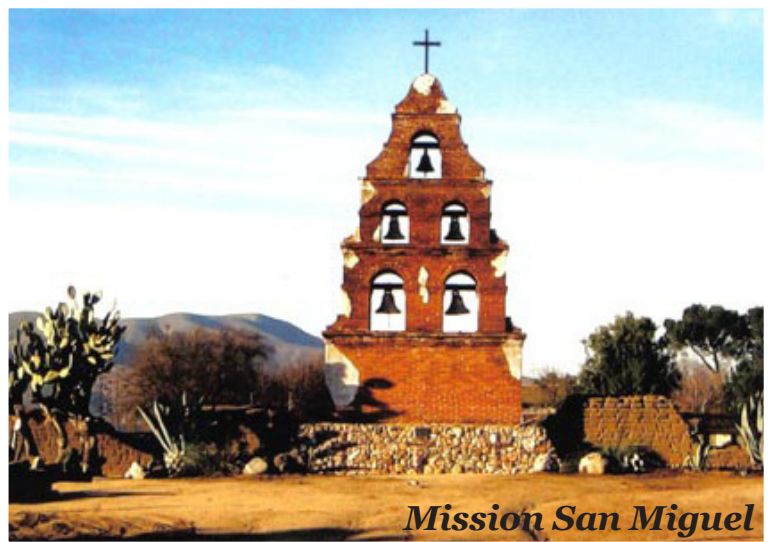
Mission San Miguel

San Miguel is positioned 10-miles north of the mid-point between Los Angeles and San Francisco. The Ranch is a short 15 minute drive from the Paso Robles Municipal Airport which offers Fuel & Line Services, Aircraft Maintenance, Air Charter, Hot Air Balloons, Restaurant and Ground Transportation. The airport also has a Jet Center and private hangars available for general aviation. Just 42 miles from the Ranch is San Luis Obispo County's Regional Airport, with commercial service daily to Los Angeles and San Francisco connecting to International flights. The San Luis Obispo Airport offers convenient access to and from the Central Coast. Residents and visitors have the choice of two commercial airlines with flights to Los Angeles, Phoenix, and San Francisco. The airport is also home to full service general aviation and corporate facilities.